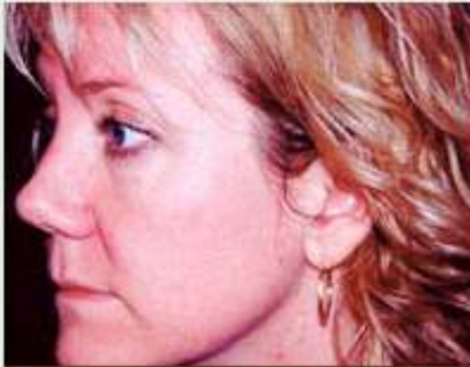
Before Light Therapy Treatment