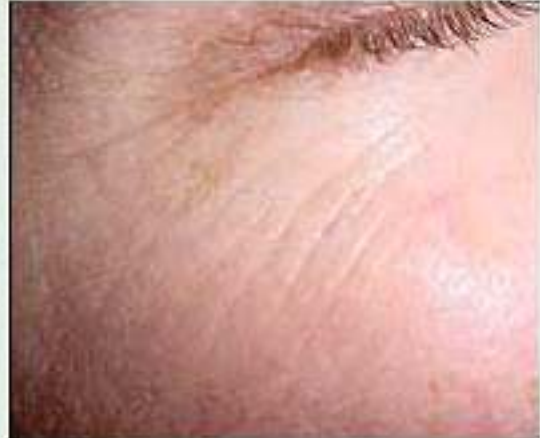
44 year-old smoker after 1st treatment