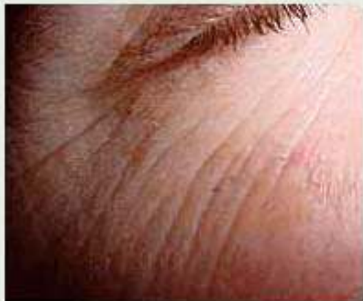
44 year-old smoker before 1st treatment