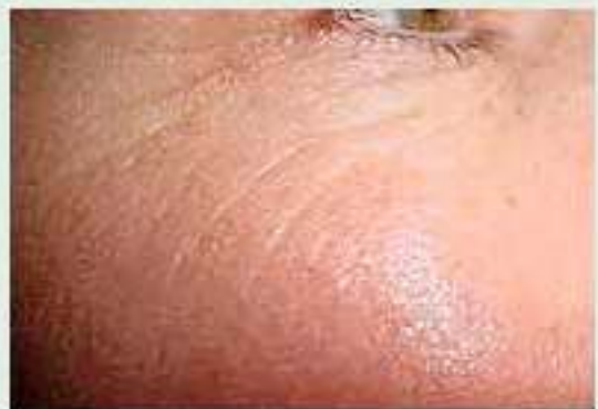
50 year-old woman after 2nd treatment