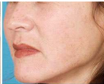
3 weeks after 1 Tx.