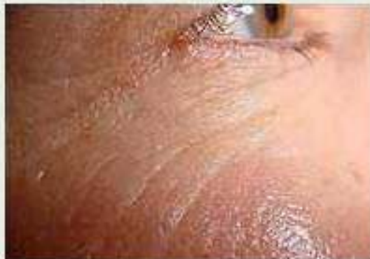
50 year-old woman after glycolic peel, but before 2nd treatment