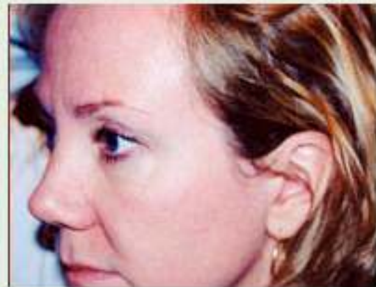
After Light Therapy Treatment